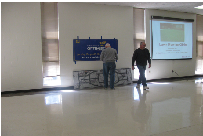
Our Volunteers setting up.