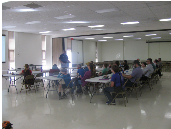
The aspiring entrepreneurs